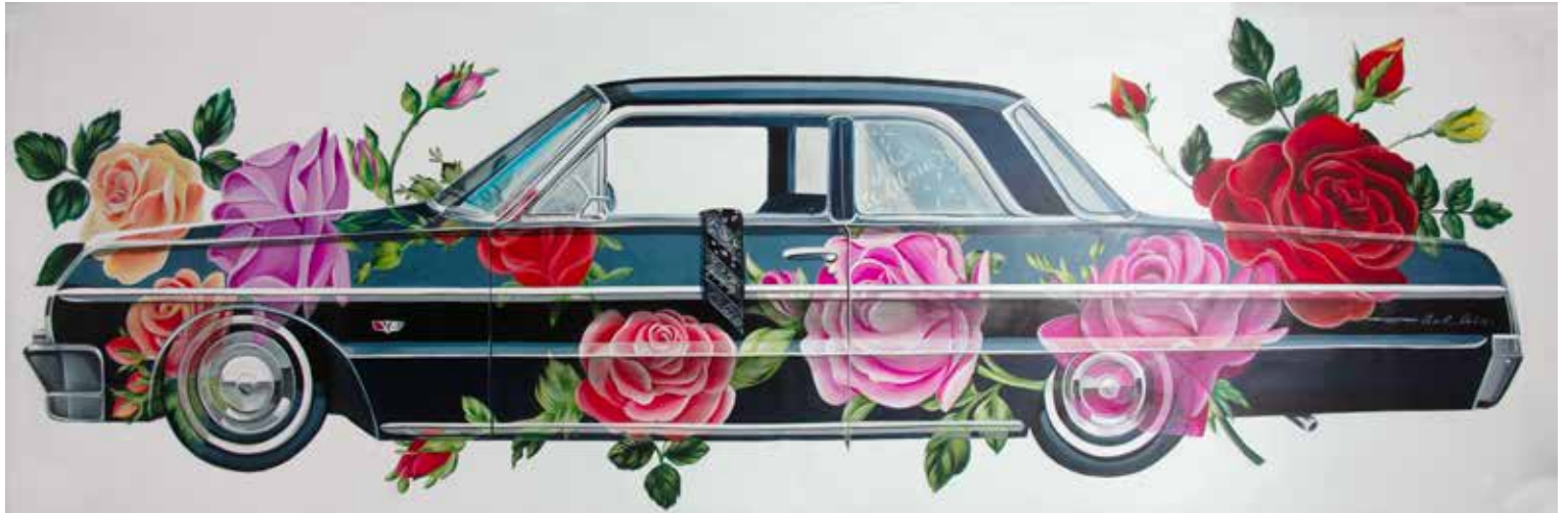
Nanibah Chacon, What Dreams Are Made Of , 2018. Acrylic paint on Polytab; 6 × 17 ft. Collection of the artist. © and courtesy of Nanibah Chacon. Photo provided by artist Nani Chacon