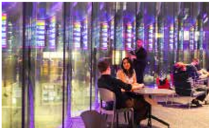
Sensory Friendly Morning, January 2023; The Sensory Garden; Visitors at Untitled: Artist Takeover, April 2023.