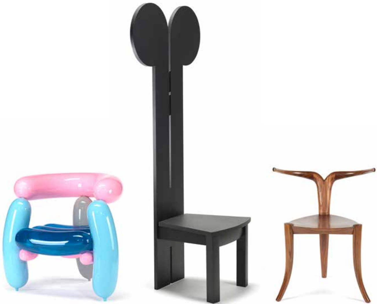
Seungjin Yang, Blowing Armchair 1 , 2019, this example made 2022. Epoxy resin and balloons; 29 ½ × 31 ¼ × 26 ½ in. Denver Art Museum: Funds from the Architecture and Design Collectors' Council, 2022.163 © Seungjin Yang; Wendy Maruyama, Mickey Mackintosh Chair , 1981, this example made 2022. Maple and Zolatone paint; 70 × 30 ¾ × 20 ¼ in. Denver Art Museum: Funds from Gayle and Gary Landis and Design Council of the Denver Art Museum, 2023.11. © Wendy Maruyama; Jomo Tariku, Nyala Chair , 2017–19, this example made 2021. American walnut; 30 × 24 × 20 ¾ in. Made by David Bohnhoff. Denver Art Museum: Funds from Gayle and Gary Landis, 2021.392. © Jomo Tariku